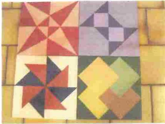
4 Different Designs